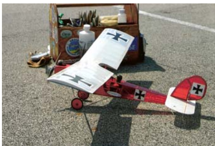
A German "Stahlwerk" Half-A Scale Model