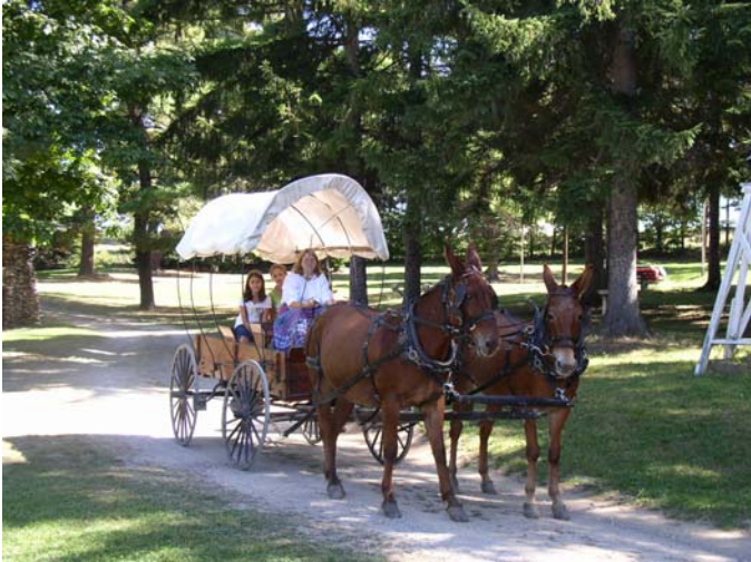
The mule pulled covered wagon approaches the flying field and demo area during "Heritage Days"