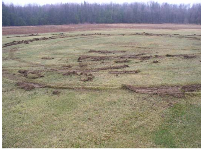
Midfield shot showing some “donuts”

Here Fred Rohde attempts to fix some of the sod which was ripped up!