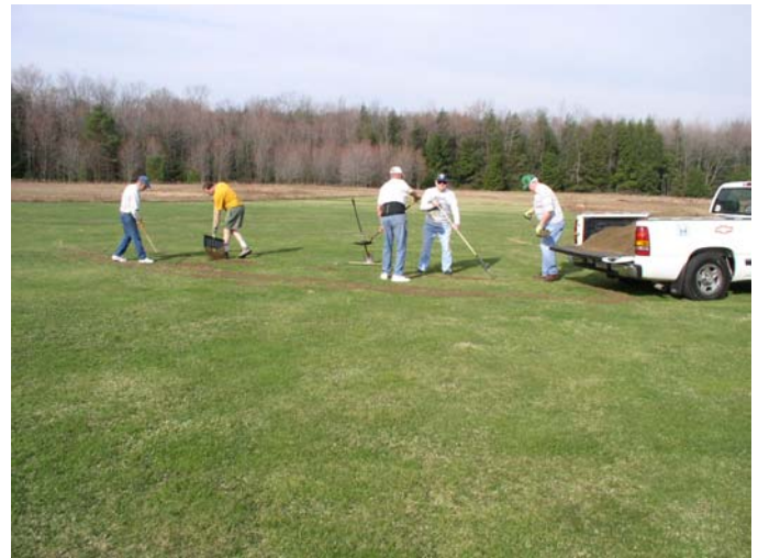
Above. a group of the guys help to spread the topsoil and rake in the grass seed!

In the picture to the right, the gang works to fill in the gaps with topsoil, and then rake it smooth for the grass seed. After that, we rolled it with Jeff's Kubota tractor. Let's hope that during the coming two weeks we get some adequate rain to help bring the grass up!