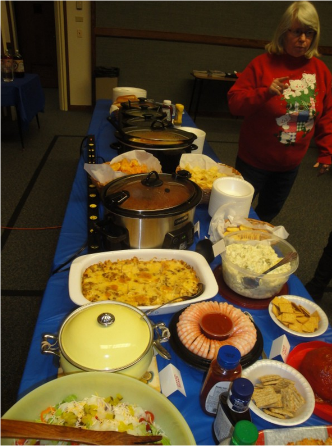
Just a sample of the wonderful food!