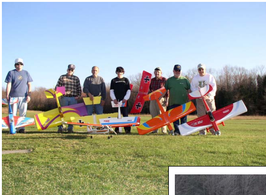
Picture to the left is from a late April evening flying night! We have had lots of rain, but good flying has been able to be enjoyed!