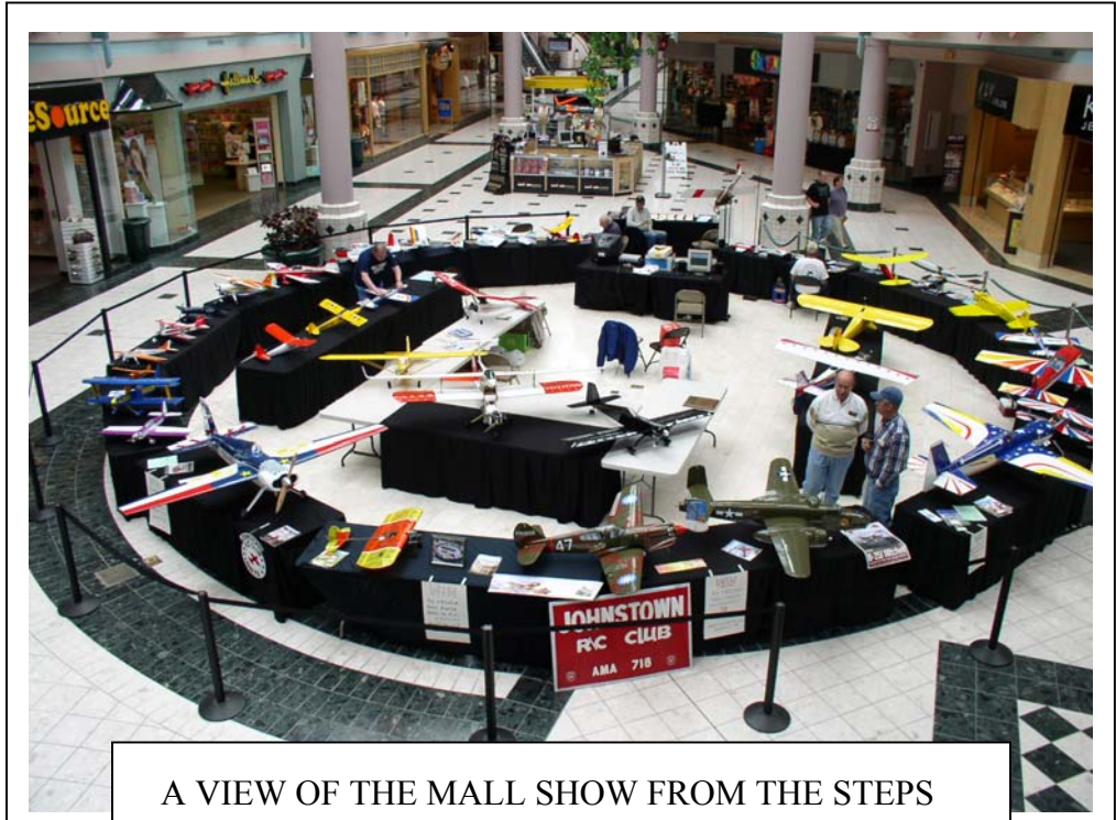
A VIEW OF THE MALL SHOW FROM THE STEPS