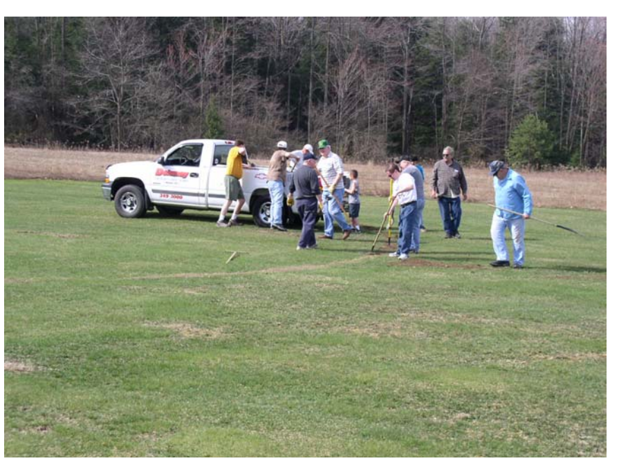
We had a good turnout on Saturday, April 18 th for the work-day. At least 20 club members showed up to help fix the damage and put up the tarp on the shelter.