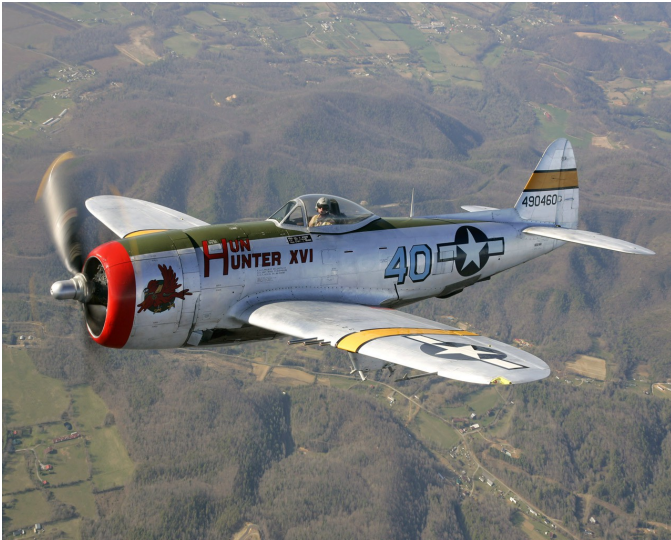
Here's a shot of a beautifully restored P-47

fighters in WW II and served with other Allied Air Forces, notably those of France, Britain and even Russia. The armored cockpit was roomy inside, comfortable for the pilot, and offered good visibility. The modern day U.S. Air Force ground attack aircraft, the Fairchild Republic A-10 Thunderbolt II takes its name from the P-47, but is also often called the Wart Hog.