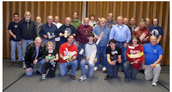
A group picture from the 2009 Fly-In