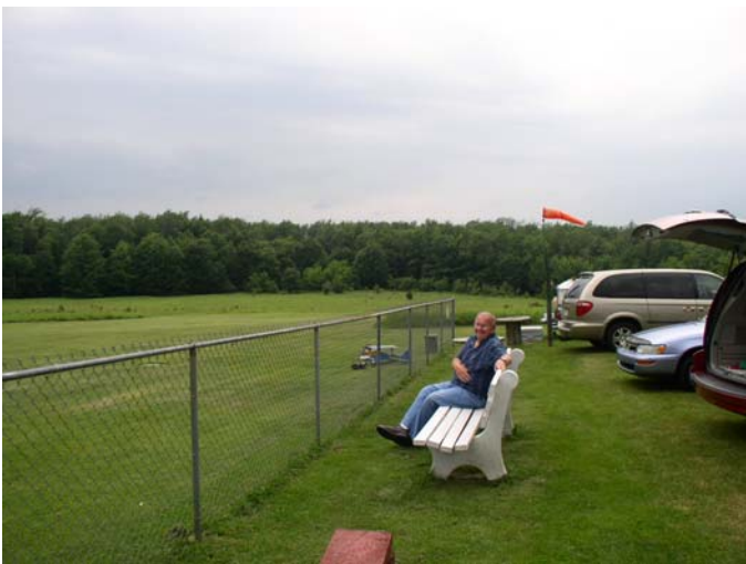
As you can see above, Grant Moore waits for the windsock to slow down a bit prior to the cookout.