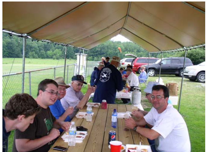
The Family Picnic on June 28 th