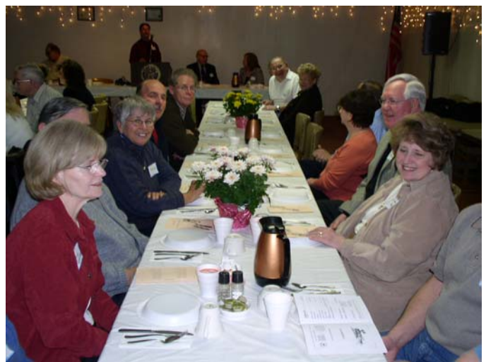
A good meal enjoyed by all of us!